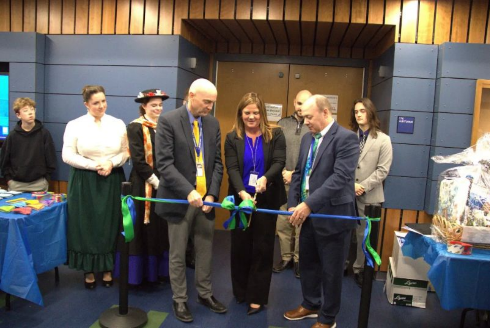
Ribbon cutting at the newly renovated CNS auditorium