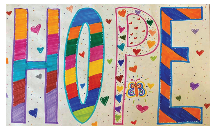
Pictured above: Student artwork shared on social media during the building closure brings HOPE for a brighter future.

In the past several years, as the District's financial situation had improved, we had been fortunate enough to expand offerings for junior high and high school students as part of Vision 2020 . This budget proposal maintains and expands those important